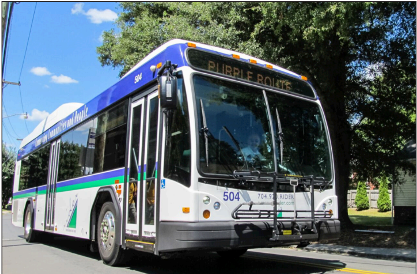
CK Rider Transit Service Bus

The MPO will continue to evaluate congestion criteria and their effectiveness in conveying congestion levels and overall delay. MPO staff compiles information on intersections and travel delay. (As to be expected, several of the intersections overlap with the list of congested corridors.) To further analyze the congested corridors, the MPO will need to conduct more extensive performance measures such as travel time studies. The network will also be re-examined through subsequent accident data and Regional Model updates.